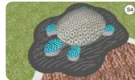
Habitat – reeds and flora