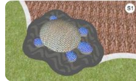
Habitat – water ripples

In the words of the artist. "Our aim is that the suite of artworks is like a collage of layered information that encourage enquiring minds to think beyond themselves and invite curiosity and an appreciation of the world around them with a goal that they become meaningful and enduring works that are much loved by the children as part of their routine outdoor play."