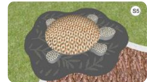
Leaves and Flora